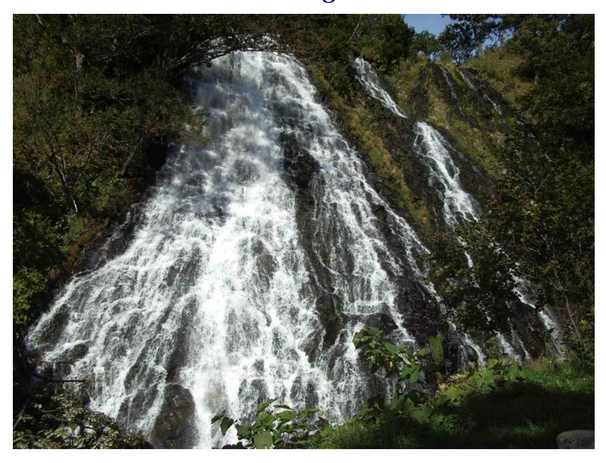
Japan's Third World Natural Heritage Site, Shiretoko in Northeastern Hokkaido